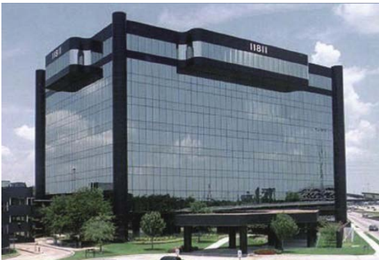
Air Logistics' Customer Service Centre offices are located in this building in Houston

The group has made considerable investment over the last eight years to develop its infrastructure and staff, including the launch of our Customer Service Centre in Houston in 2008.